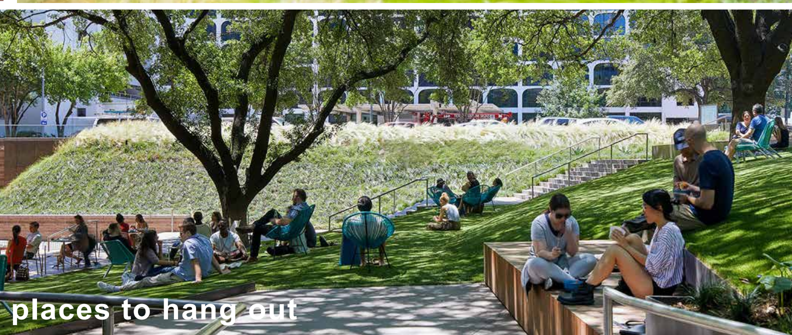
places to hang out