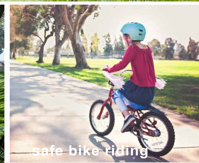
safe bike riding