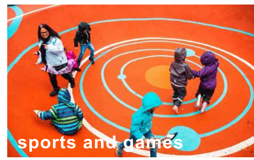
sports and games