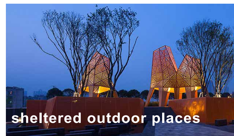
sheltered outdoor places