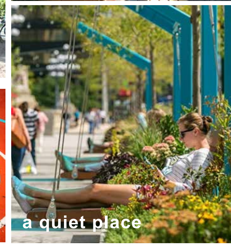
a quiet place