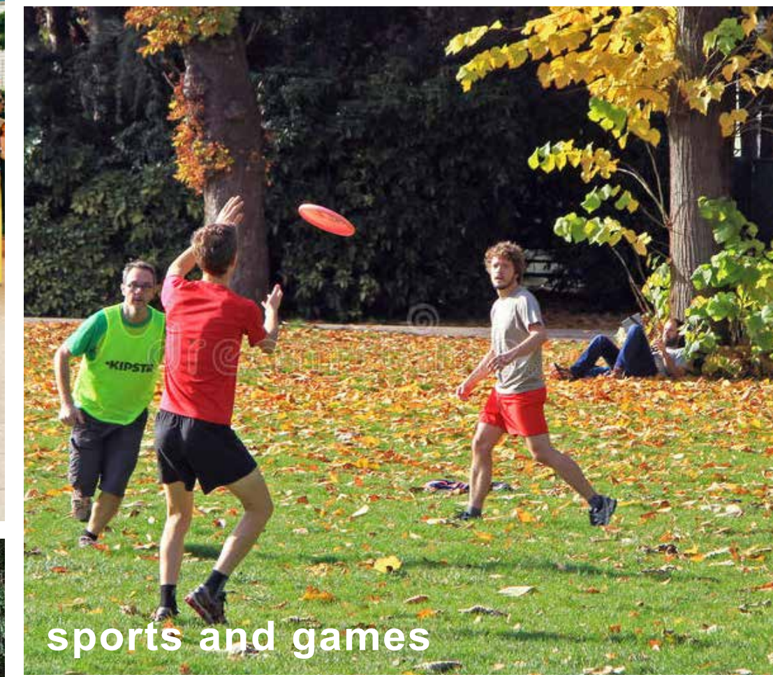
sports and games