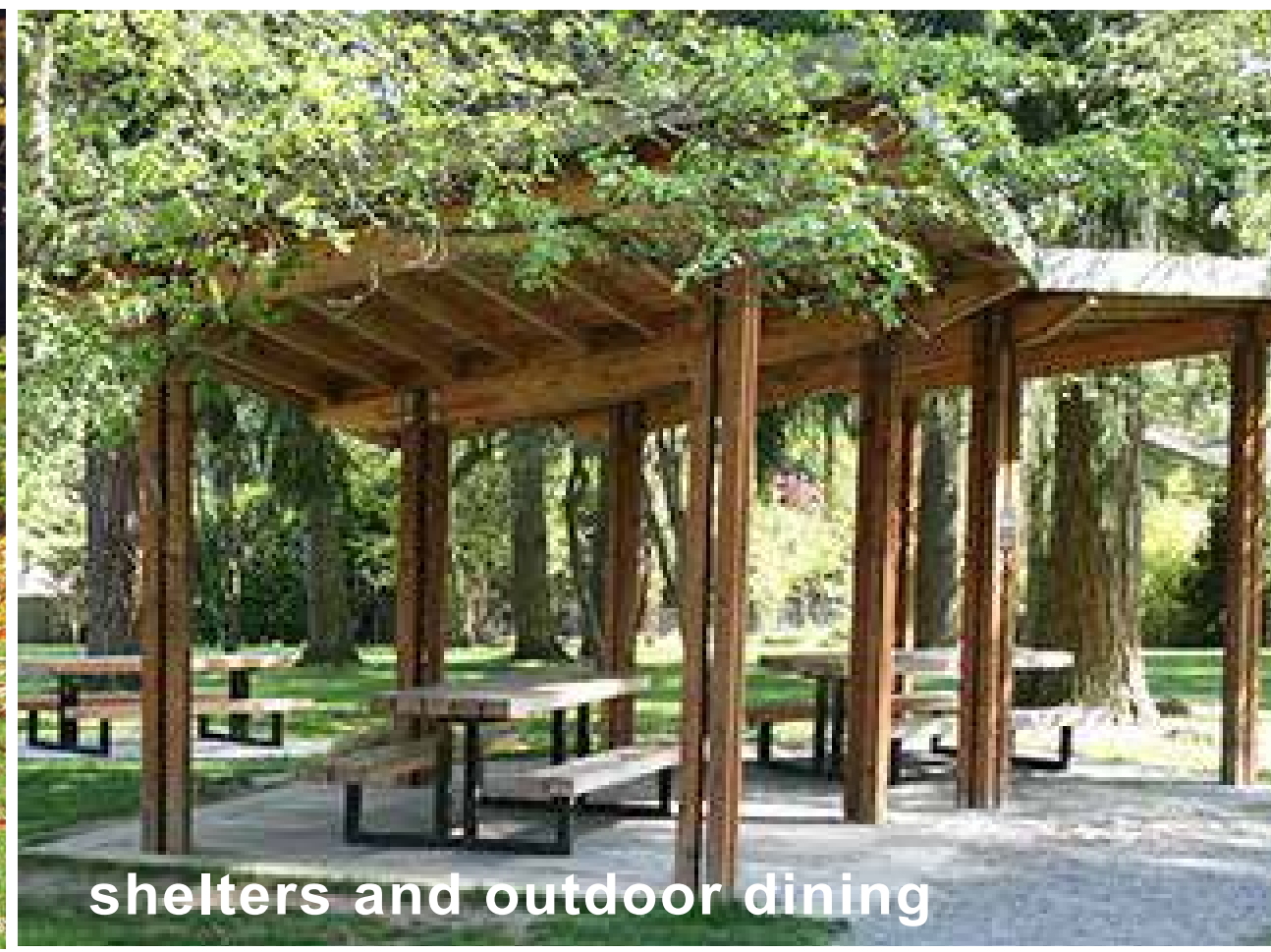
shelters and outdoor dining