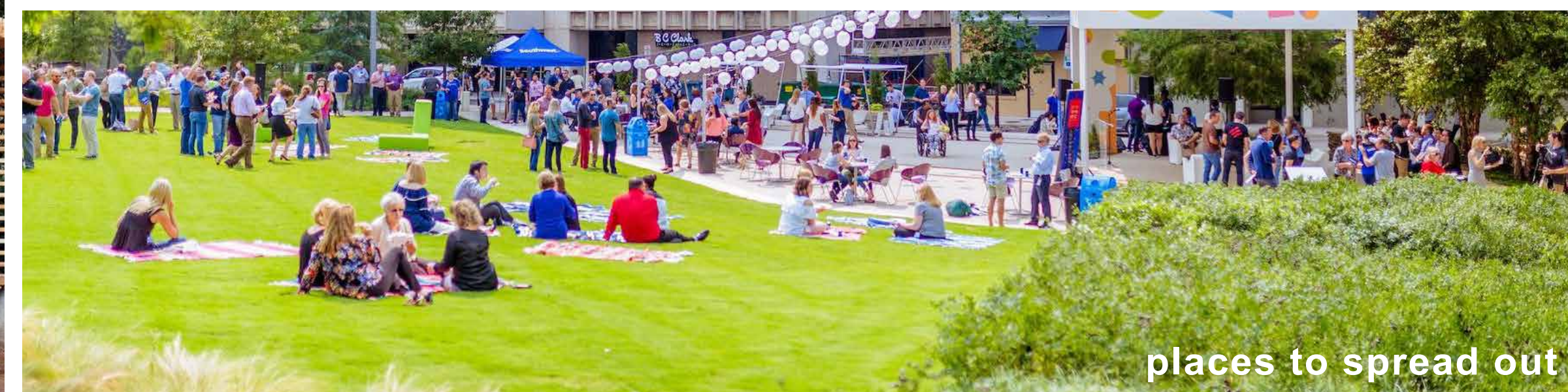
places to spread out

What activities would you recommend for the green, open space?